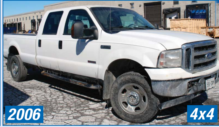
FORD F350 XLT SUPER DUTY 4X4 PICK UP