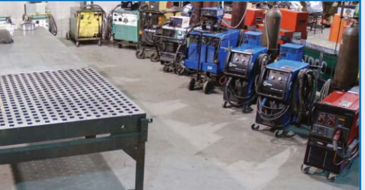
VIEW OF ACORN TABLE AND WELDERS