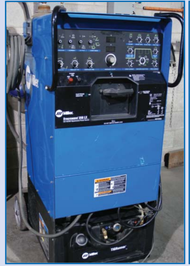
MILLER SYNCROWAVE 350LX