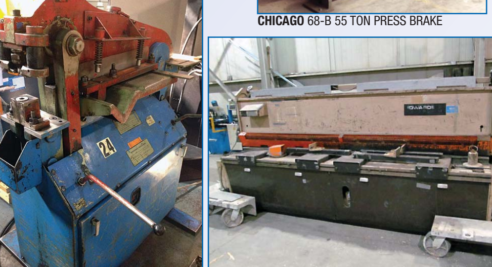
PIRANHA P-36 HYDRAULIC IRON WORKER