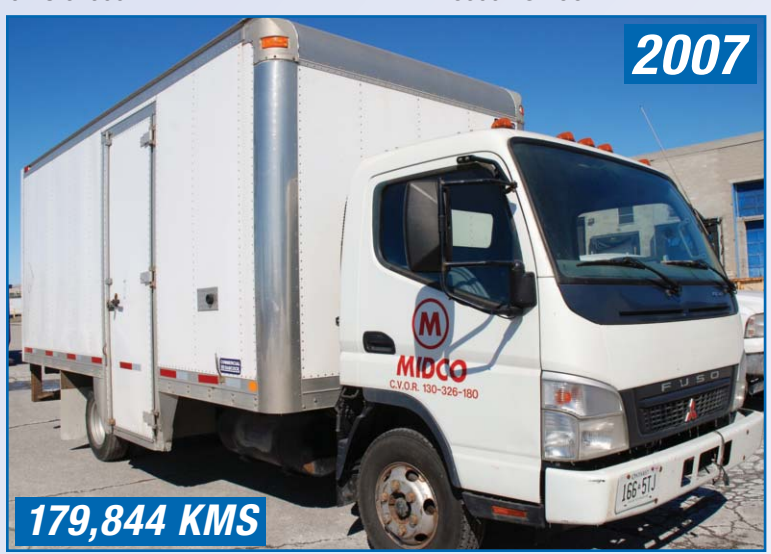
MITSUBISHI FE145 FUSO TRUCK