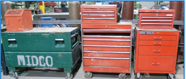
JOB AND TOOL BOXES