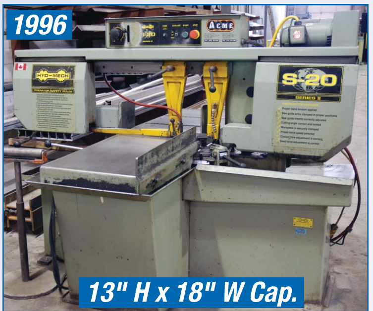
HYD MECH S20 HORIZONTAL BAND SAW