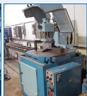
EISELE PSU 450G COLD SAW