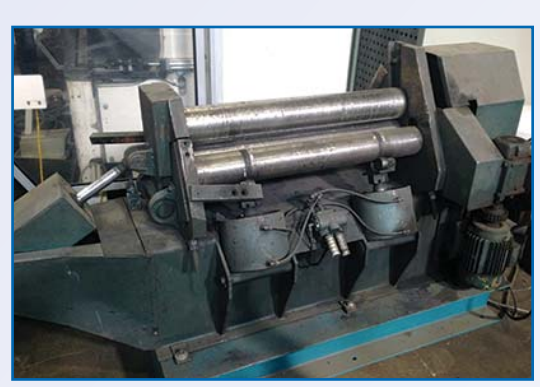
ELAM 3' X 1/4" 4 ROLL INITIAL PINCH ROLLS, 5" DIA ROLLS