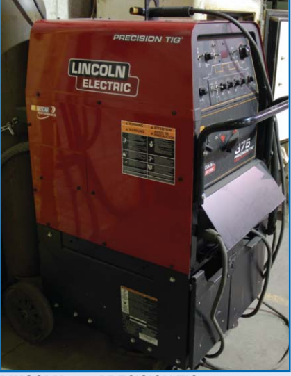
LINCOLN 375 PRECISION TIG