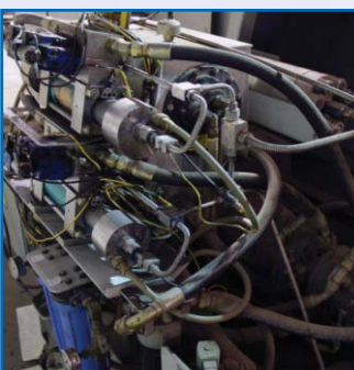
FLOW CNC CONTROL AND TABLE