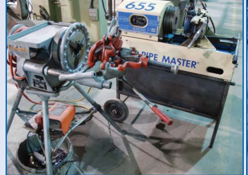
VIEW OF POWER THREADERS