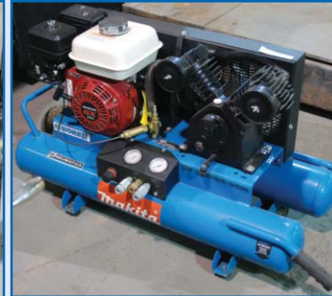
MAKITA PORTABLE AIR COMPRESSOR