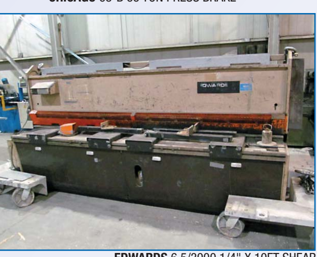
EDWARDS 6.5/3000 1/4" X 10FT SHEAR