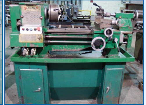
BUSY BEE TOOL ROOM LATHE