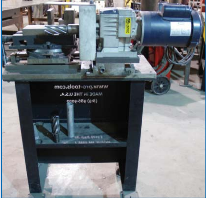
PRO TOOLS BORING DRILL