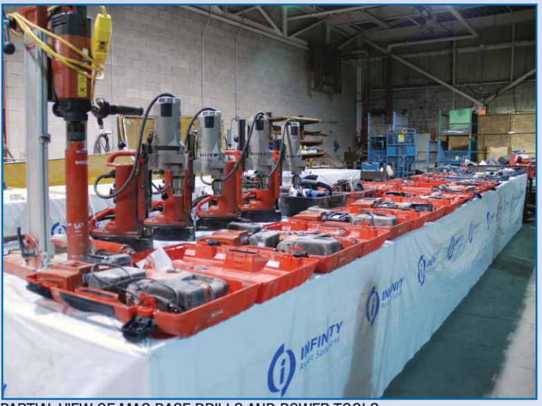
PARTIAL VIEW OF MAG BASE DRILLS AND POWER TOOLS