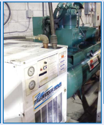
CHAMPION 15HP AIR COMPRESSOR AND DRYER