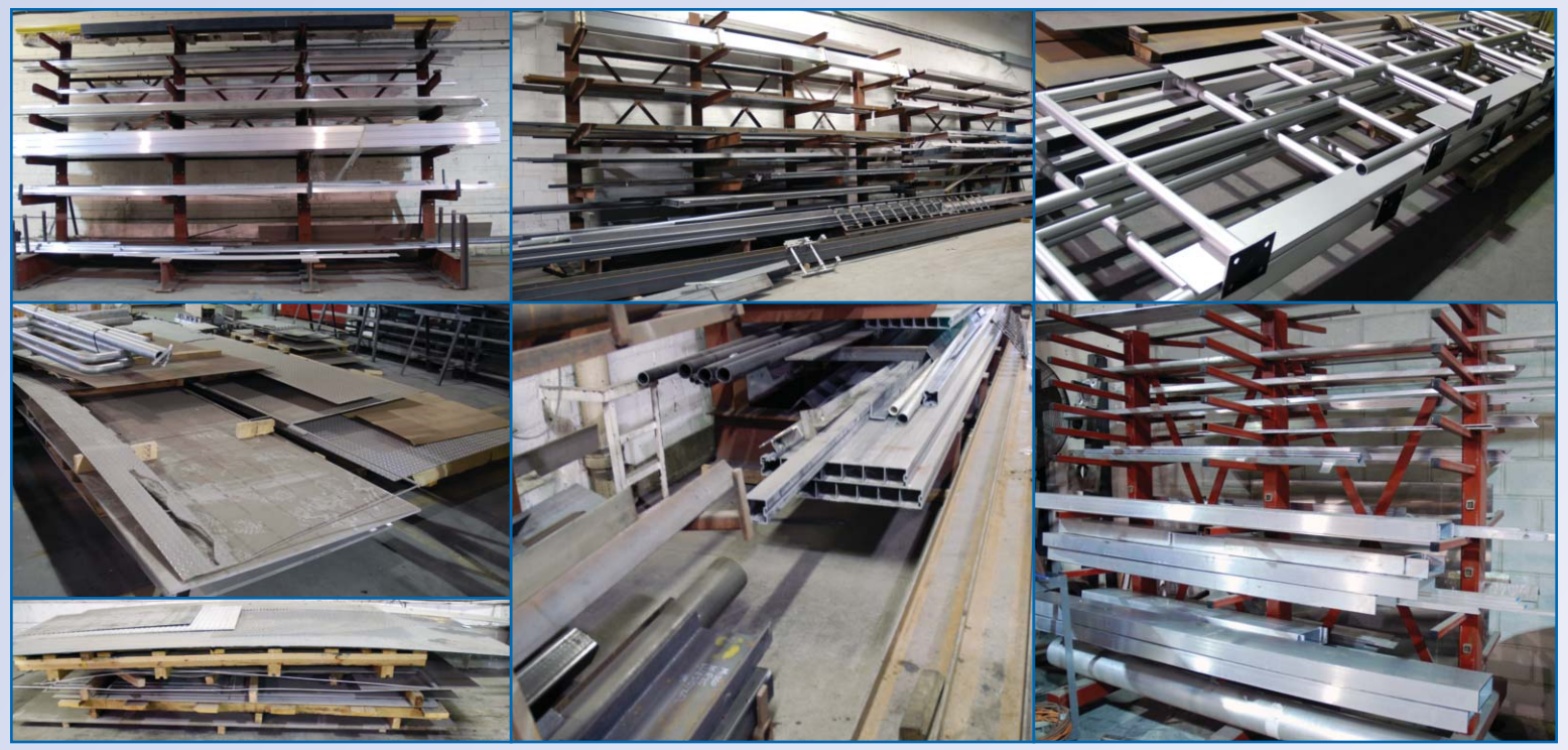
LARGE QTY WIP & RAW MATERIAL – TUBE, ROUND AND FULL SHEETS CONSISTING OF STAINLESS, CHECKER PLATE, ALUMINUM, I-BEAMS, RAILINGS ETC.