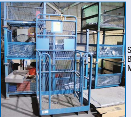
STACKABLE BINS AND MAN CAGE