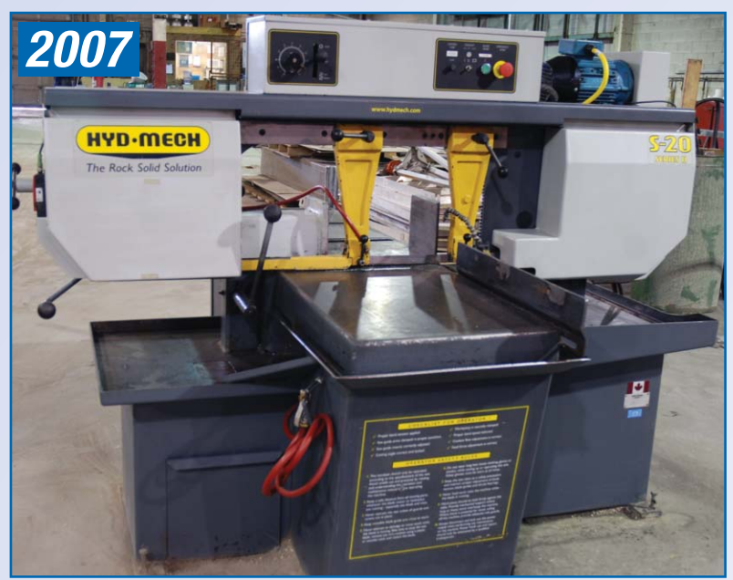
HYD MECH S20 HORIZONTAL BAND SAW