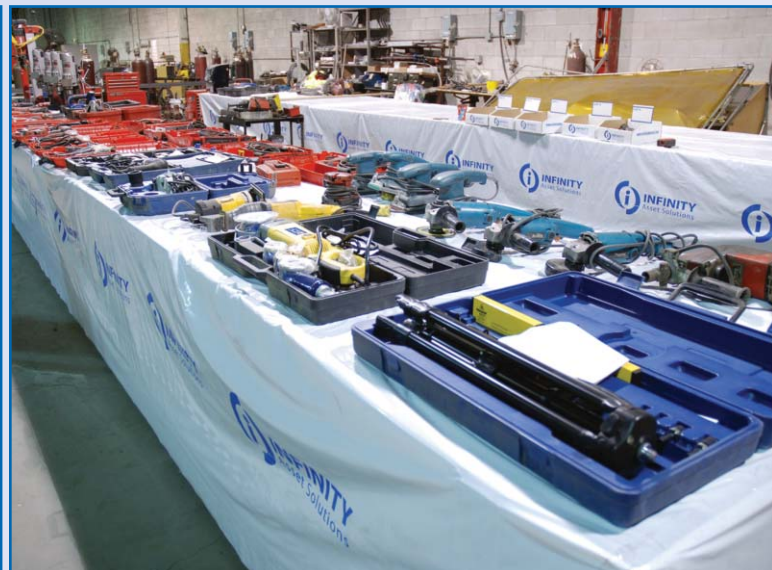
PARTIAL VIEW OF LASER LEVELS AND POWER TOOLS