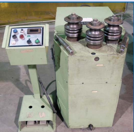
ZOPF BPR C-353 BENDING ROLLS